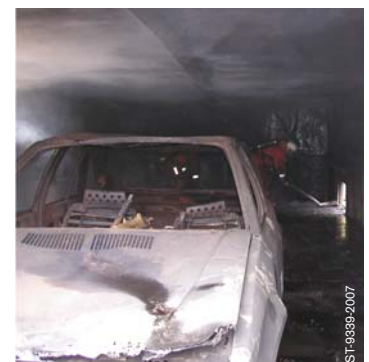
Interior of the Phase 4 Garage System