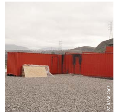
The Phase 4 System – Three year old unit in use at the Los Angeles Fire Academy.

This workshop is conducted by two experienced instructors. These instructors have conducted at least 100 training evolutions in a Phase 4 system. This training and certification process assures that instructors are thoroughly familiarized with the safe and effective use of the Phase 4 training system.